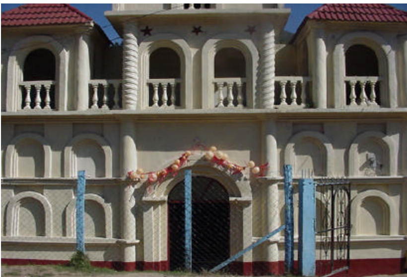
In the village of Avocado where avocados do not grow

Above left - some of the residents of the village.