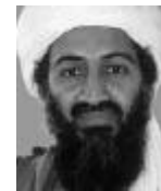
Osama bin Laden

And where is Satan's present day human general, Osama bin Laden? Is he in the forefront leading his troops? No! Like Satan he is in hiding, fearing the just retribution in the Anger of God.