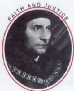
Saint Thomas More 1478-1535