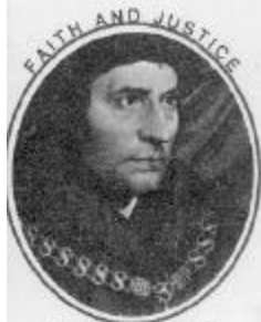
Saint Thomas More 1473-1535